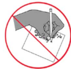
Inefficient positioning with bent wrist