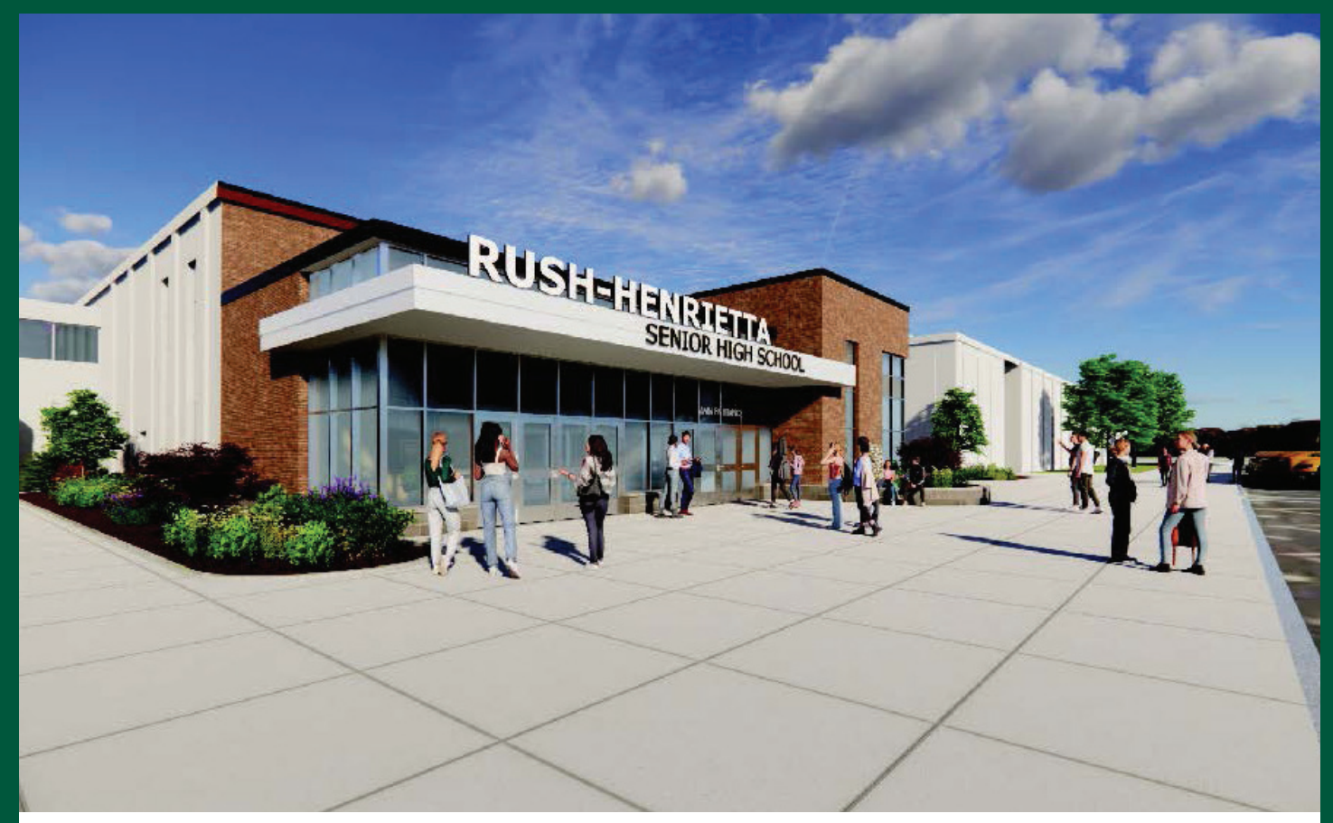
With safety and security in mind, voter approval will allow for a much larger, more secure main entrance at the Senior High School.