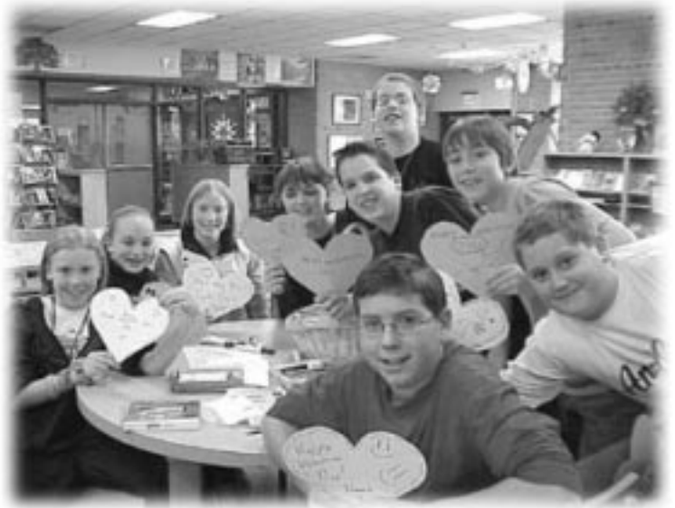
Students at Roth Middle School sent heartfelt notes of thanks to soldiers overseas.