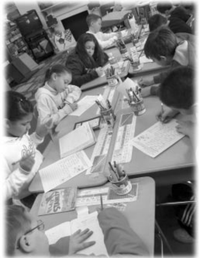
Thanks to a new teaching tool, pupils are strengthening their writing skills.