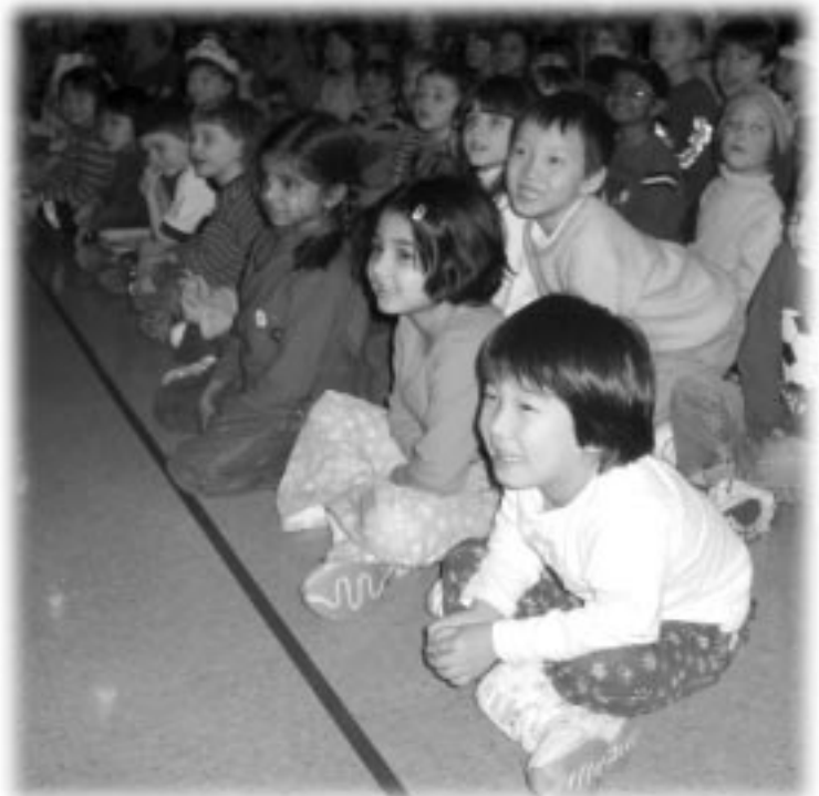
Young readers happily accepted an impromptu assignment.

PARP takes place at different times in Rush-Henrietta elementary schools. The goal is to get students more involved in reading, especially with their families. Parents are asked to read with their children for at least 15 minutes a day, five days a week for a month.