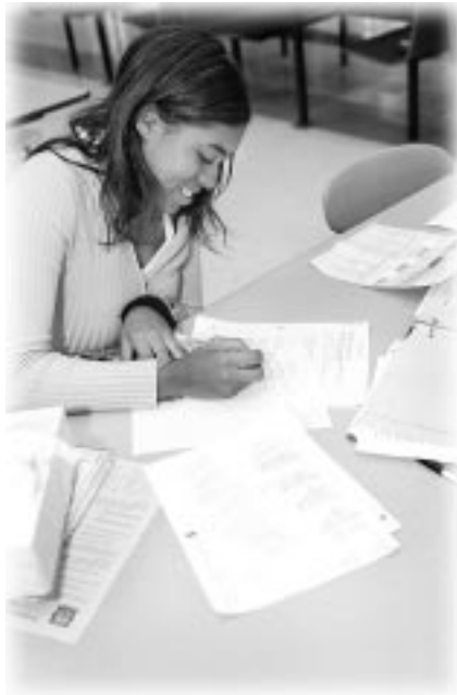
A new video, "Math for All," is available to the community for viewing.

Rush-Henrietta continues to stress student achievement in mathematics, and its curriculum, instruction, and assessments are designed to encourage success.